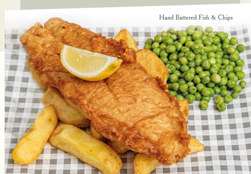
Hand Battered Fish & Chips

Served with hollandaise sauce for 75p extra.