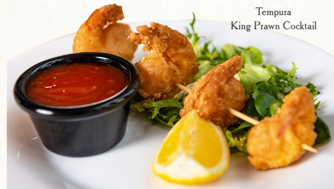
Tempura King Prawn Cocktail

Florets of cauliflower in a lightly seasoned batter, served with mixed leaves and a smokey BBQ dip.