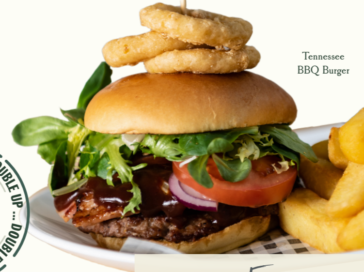
Tennessee BBQ Burger

6oz Aberdeen angus burger stacked with bacon, melted cheddar, a Louisiana-style chicken fillet and onion rings.