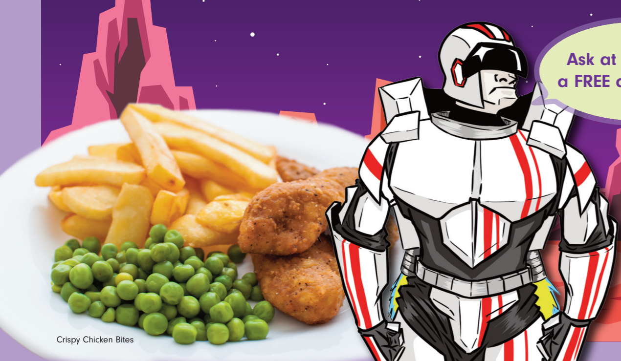
Crispy Chicken Bites