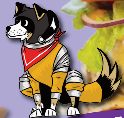
Bacon & Cheese Burger

A crispy chicken fillet, in a toasted brioche bun, with lettuce, red onion and tomato. Served with a side of chips.